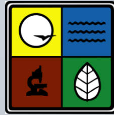
Missouri Department of NATURAL RESOURCES